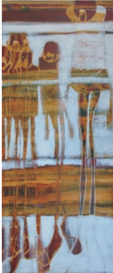
Oh yeah baby! 168 x 71cm

Bold, aggressive, subtle, evocative female energy