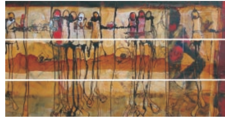
Indaba Spirits 90 x 167cm