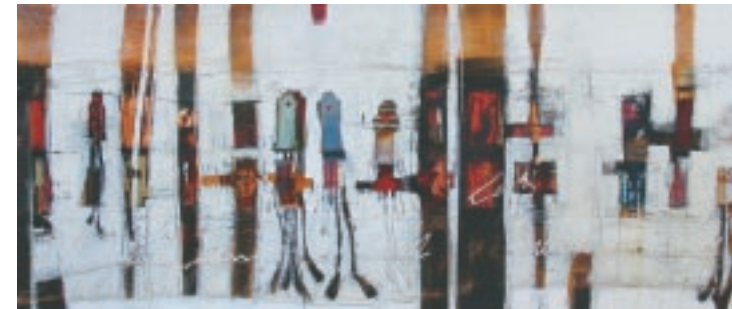
Every bit of you 70 x 104cm