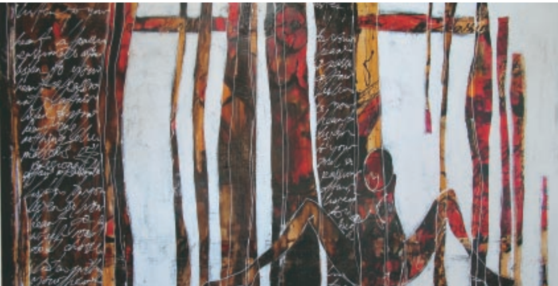
Passionate Affair 1.5 x 3m